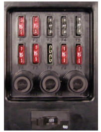
Master Disconnect Switch